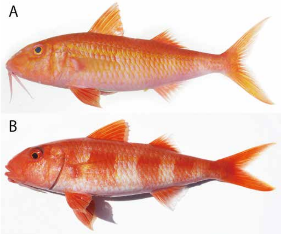
Fig. 2. Fresh specimen (A) and live specimen just removed from water (B) of Mulloidichthys pflugeri (MUFS 47000), 189.0 mm SL, off north of Yonaguni-jima island, Yaeyama Islands, Okinawa Prefecture, Japan, line fishing, 30 m, 22 Sept. 2015.