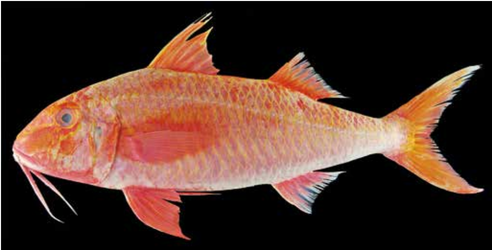
Fig. 1. Fresh specimen of Mulloidichthys pflugeri (KAUM-I. 72443), 348.2 mm SL, off Amami-oshima island, Amami Islands, Kagoshima Prefecture, Japan, line fishing, Nov. 2015, landed at Naze Fishing Port.