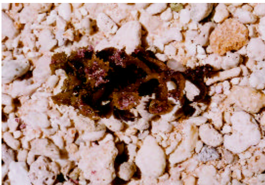
Fig. 4. Turbinaria conoides on a coral beach of Mogmog Is.