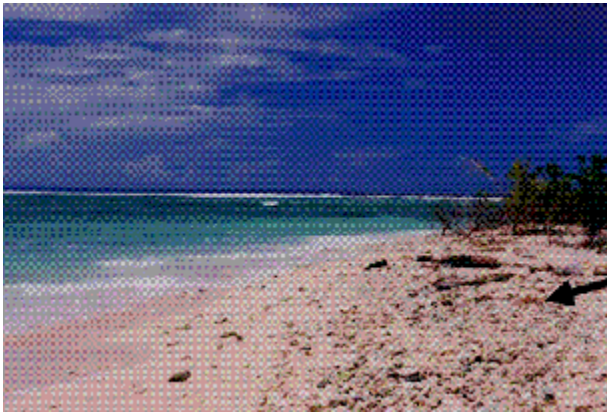
Fig. 3. Brown alga Turbinaria conoides cast up on shore of Mogmog Is., Ulithi Atoll

On all of the islands, where algal flora was studied in our field trip, Turbinaria conoides was often seen cast up on shore (Fig. 3–4). While this brown alga may be distributed on the reef edge of the atoll, the authors could not collect live specimens by snorkeling. The outer edge of the atoll was washed by strong waves caused by a typhoon during the field trip. The dinoflagellate Gambierdiscus toxicus that is known as the cause of ciguatera fish poisoning, was detected on the thalli of these semi-dried Turbinaria on the beach (Fig. 4). Fortunately the authors had an opportunity to collect Turbinaria on the southern beaches of Fassarai Is. and several cells of Gambierdiscus toxicus were identified attached to the surface of the algae. East of Ulithi Atoll, near the fishing grounds of Falalop Is. and Fassarai Is., the possibility of Gambierdiscus toxicus attached to benthic brown alga may have contributed to the poisoning of ciguatera associated fish.