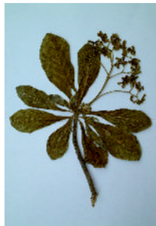
Fig. 5. Messerschmidia argentea collected from Asor Is., Ulithi Atoll. Local name called lippi .