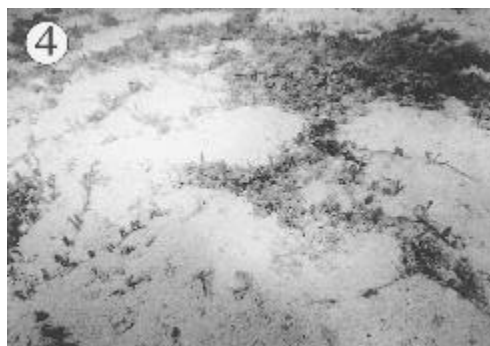
Fig. 4. Caulerpa population growing on the sandy bottom at St. 33 (Yap, 2 m depth)