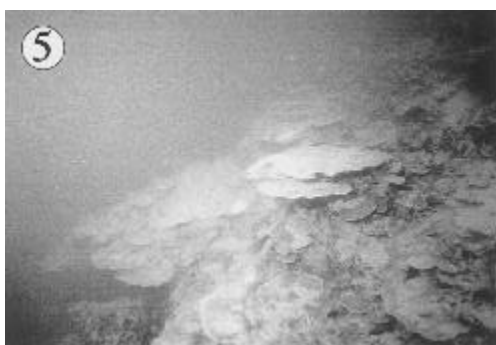
Fig. 5. Coral reef at St. 35 (Yap, 20 m depth)