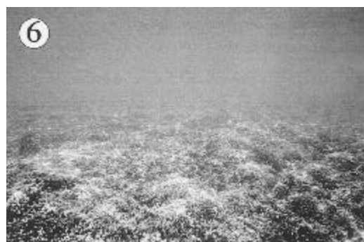
Fig. 6. Coral reef at St. 15 (Ulithi, 2 m depth)

Figs 3-6. Substrata of the study sites in Yap Island and Ulithi Atoll during the survey in October 2001