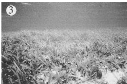
Fig. 3. Seagrass beds at St. 31 (Yap, 1.5 m depth)